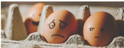
Treating Others Kindly (teenagers)