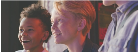
Relationships, Kindness and Success