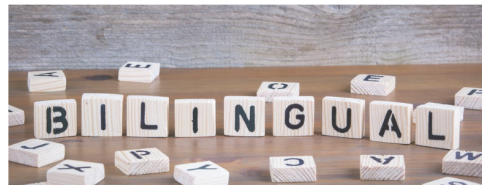
Raising A Bilingual Child

Don't forget to follow us on social media to stay up-to-date with all of our latest updates and resources. Find us on Facebook , Instagram , Twitter , and LinkedIn .