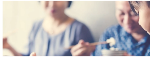
65 Topics for Dinnertime Chat