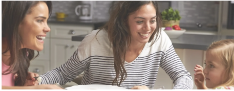
Family Talk: Podcast